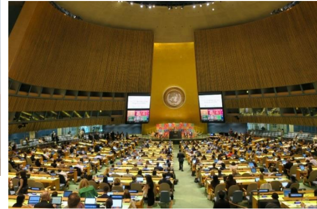
SDGs Business Forum held at UN General Assembly Hall (July 18, 2017)